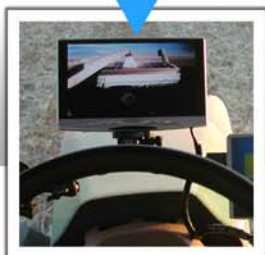
Combine to cart

Other available Ranch Hand components (check our product listing for available kits)